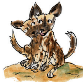
WILD DOG MBWA MWITU