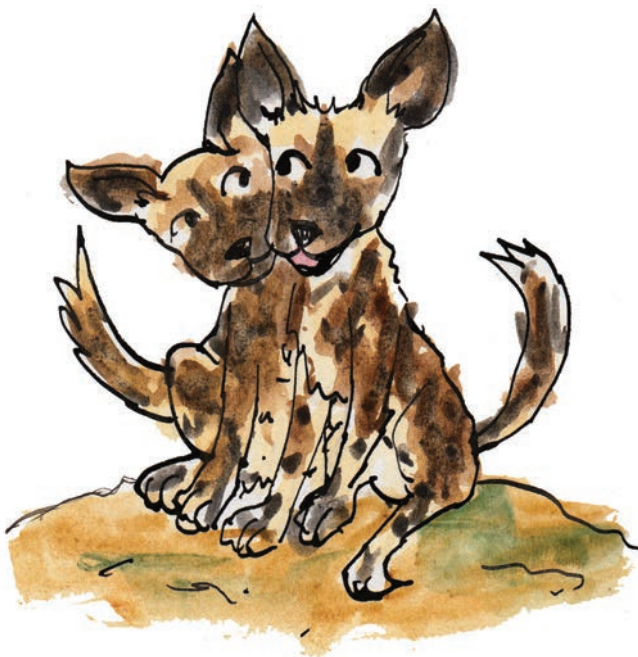
WILD DOG MBWA MWITU